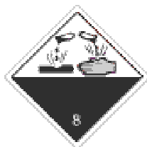
Label no.8 Corrosive substances