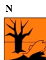
Dangerous for the environment